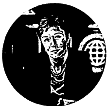
Susie Hargreaves OBE