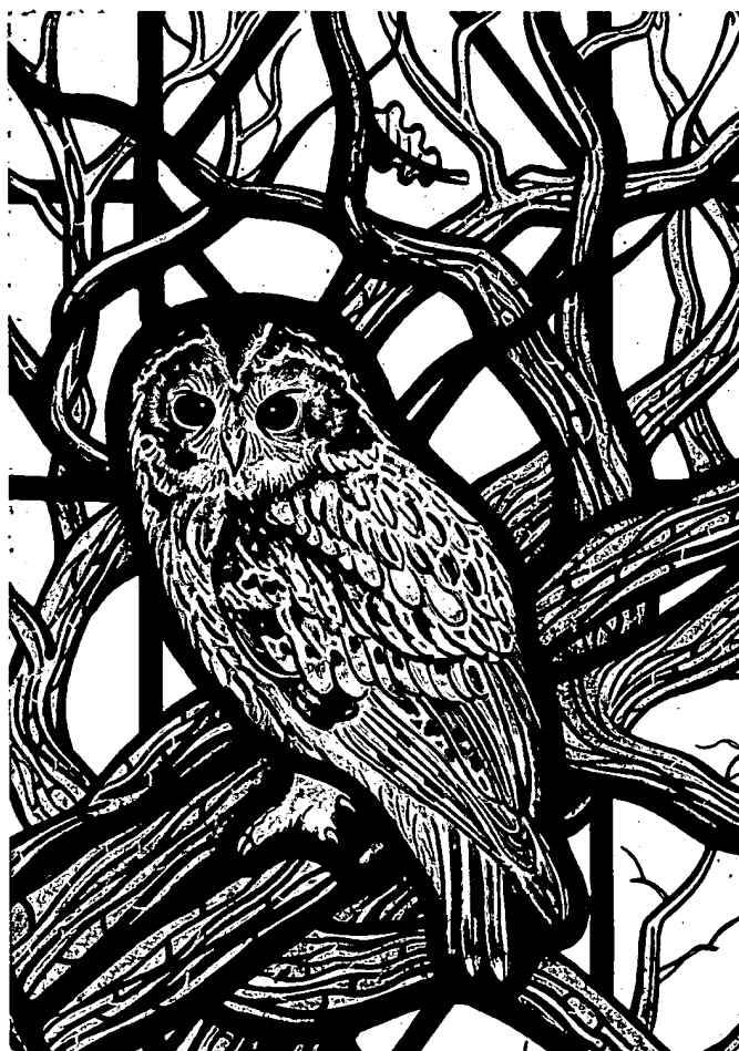
Holy Trinity Church, Acaster Malbis

Further studio refurbishment and improvement has continued and the YGT/Minster stone yard R&D project has borne fruit in terms of the research and acquisition of equipment to facilitate digital templating and the safer lifting and manipulation of panels on site.