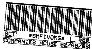
Paul & Williamsons Secretaries

"That the name of the Company be changed to "Altra Holdings Limited"."