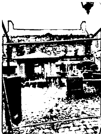
Citizens Advice North Oxon & South Northants and 4 others

Visit Banbury Community Interest Co... @VisitBan... · 14 Nov 2021 ... Hi @BrakspearPubs any chance someone can give some urgent attention to the former JTs pub in Banbury as it is an eyesore & will soon start becoming a magnet for other negative activities in town. Would really appreciate it please. Thanks