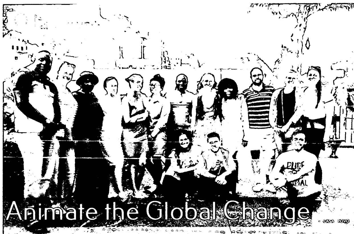
EVALUATION MEETING IN PORTUGAL

The process of the project is driven by the experiential learning principles, having a very strong practical components and adequate time and methods for reflection, feedback, self-assessment and extraction of the learning points that will be transferred in the future. The values of non-formal education (which is the main methodology in the trainings) are intended to be part of the process of the management as well: to have an active participation and involvement from all partners according to their needs and interest, to have a project that has a shared ownership in term of management (financially and risks as well), to be driven by motivation and voluntary participation, etc.