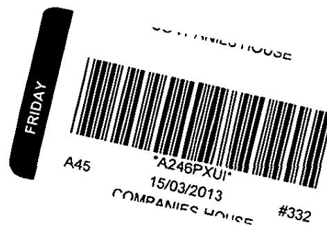
Cooper Parry LLP