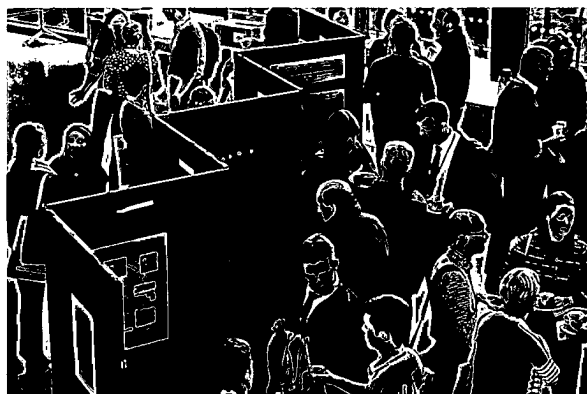
Well-being in Healthcare Education, April 2019

More detailed descriptions of the activities and the beneficial outcomes are contained in the Review of Activities in 2018/19 (below).