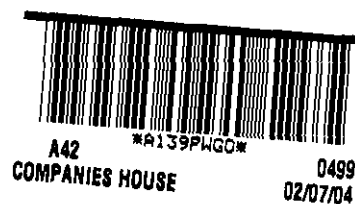
Simpart Secretarial Services Limited