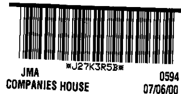
..... for and on behalf of Tricorn Group PLC