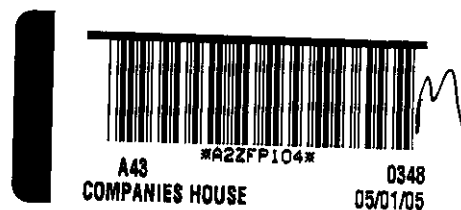
KPMG Audit Plc