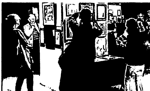
Art Course Show July 2019 – celebrating our adult students' achievements