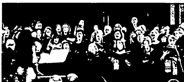
Holocaust Memorial Day concert with community choir February 2020