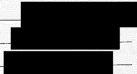
Address of Witness