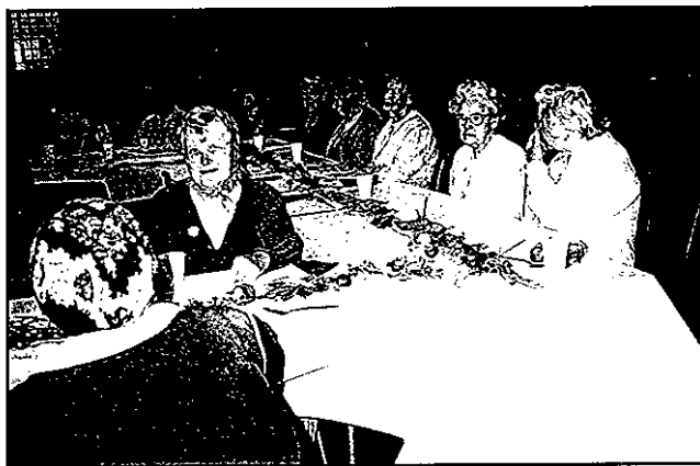
Luncheon club - A harvest celebration

Worship on Sunday is naturally the very centre of our mission. Our message of the good news does not change and can never change if we are true to Biblical truth, but we seek to make our worship service relevant as we endeavour to meet the needs of the people living around the mission. We have tried to make the service thematic and understood by the people when their language is limited. Visual aids and use of the overhead projector have been important where possible.