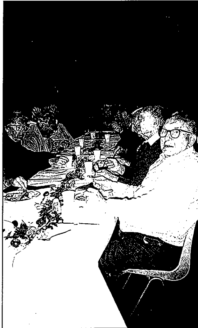
Luncheon club - A harvest celebration